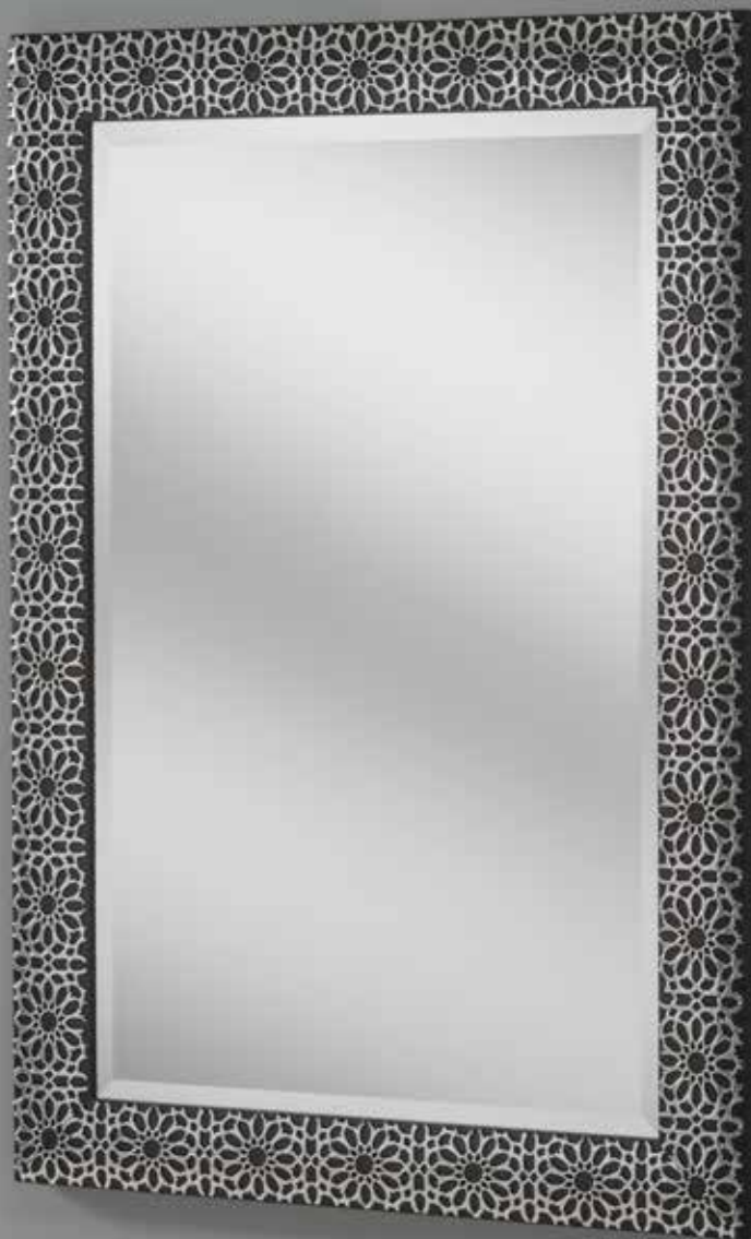
41 White / Silver